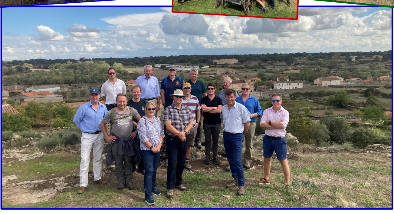
Standing on Wellington's 'Hinge Battlefield' at Fuentes