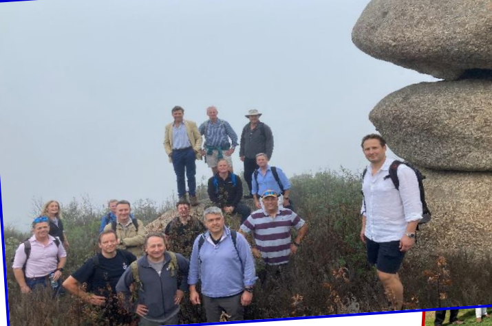
Retracing in the mist the retreat of the 52<sup>nd</sup> Foot of the Coa .....

Below: With an ammunition wagon at Fort Conception