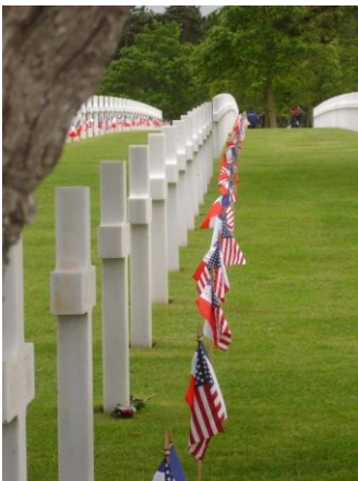
St Laurent Cemetery