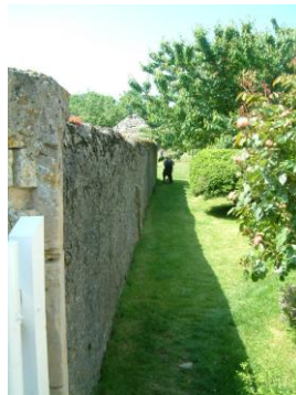
VC's route to rhubarb