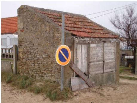
A mistaken target