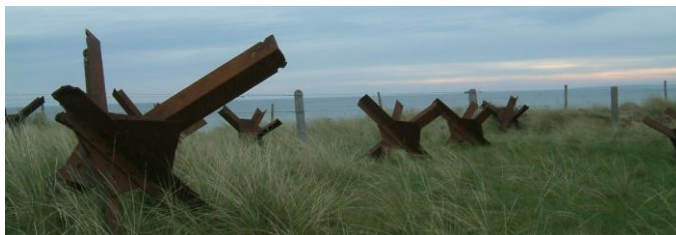
Anti tank defences Utah Beach