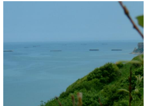
Mulberry Harbour 'B'